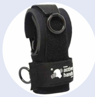
Active Hands Gripping Aid

Paddle increases surface area and helps to propel more water while swimming. Straps are stretchy and adjustable.