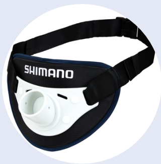
Belt Fishing Pole Holder

Stabilizes rod while fishing and reduces the grip and hand strength needed to support the weight of the rod.